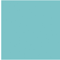
Poseidon's Paradise - 20